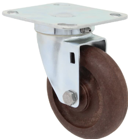
75UT50GI8206-0000Q0 With High-Temp Seal and 90° Angle Grease Fitting